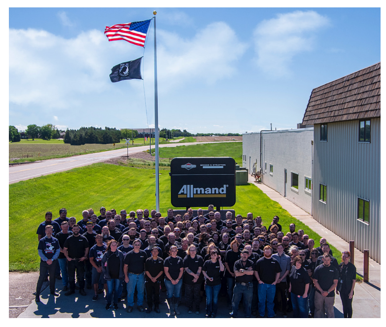
Allmand organized a flag-raising on May 27 as a sign of respect to heroes past present and future who served in the Armed Forces.

"Our senior leadership team at Briggs & Stratton is fully behind the