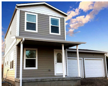
This new home at 199 Bryan Street in Loomis was built with GO! Home incentives.

The developer for the Loomis project is Legacy Purpose Homes, which is part of Legacy