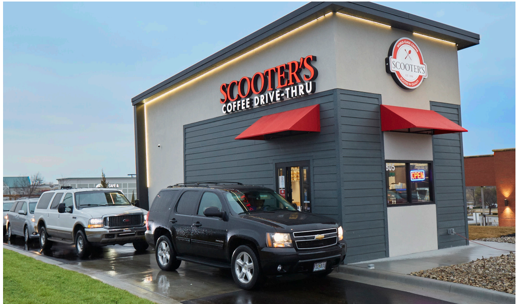
The Scooter's Coffee company will build a new drive-thru location at one of Holdrege's busiest intersections, Fourth and Burlington. It is expected to open in late 2018.

The Scooter's Brand Promise is "Amazing People, Amazing Drinks ... Amazingly Fast!"® The coffee shop specializes in hand-tamped espresso drinks, baked-from-scratch pastries and it's signature drink, the Caramelicious®, an espresso drink that can be ordered hot, iced or