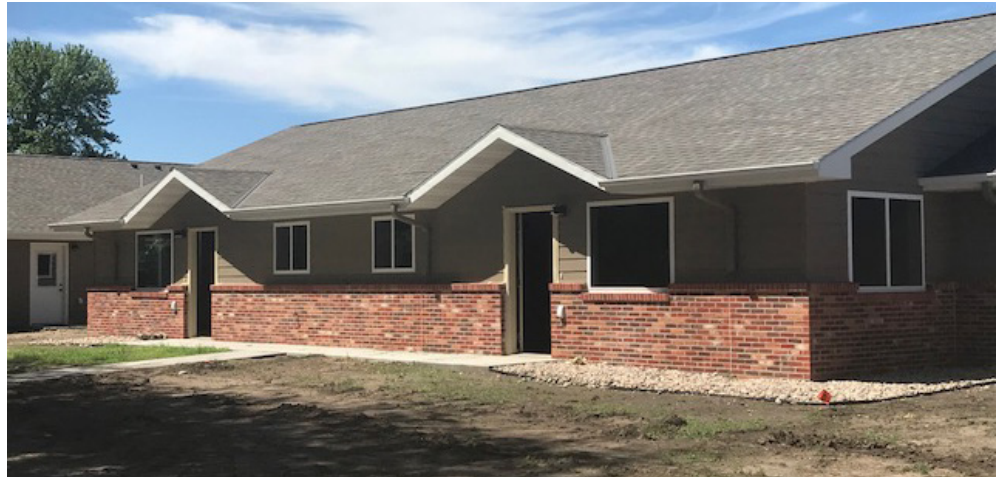
Construction is complete on the new Washington Square town-home apartments, and the new units are ready to welcome renters.