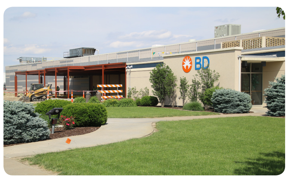
Construction work is evident outside of BD as the plant continues a $100 million expansion. Much of the investment will go toward replacing older manufacturing lines with new equipment.

"Each Community Impact story came to fruition through the tireless efforts of community leaders, local economic development authorities and state officials, along with the decisive leadership at each company that took a chance in its location decision," the magazine states. "To their cities