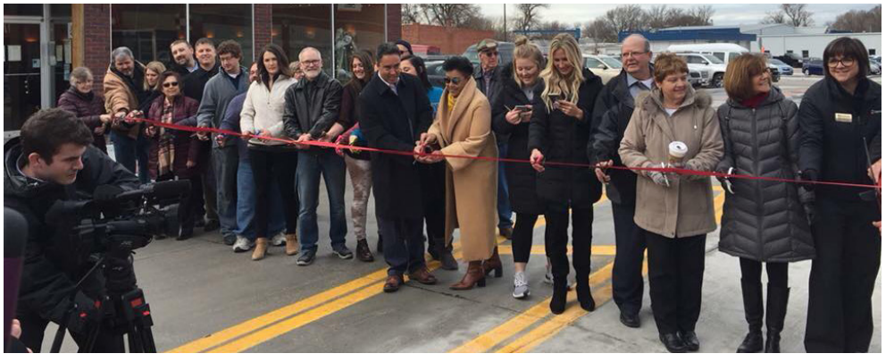
Local business owners and employees lined up to officially cut the ribbon for the Highway 6 & 34 Re-Opening Ceremony on November 29.

The Concrete Solutions team started planning for the project nearly a year before it began. They created a Facebook page to keep everyone