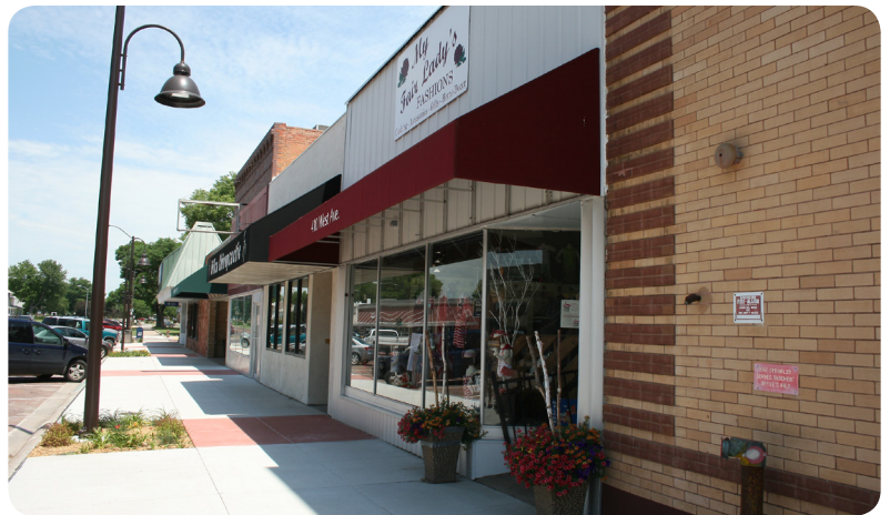
PCDC has contracted with Buxton Co., a statistics and marketing firm, to help local retailers identify new opportunities for growth.

Key said Buxton will conduct a thorough market analysis of the area to identify the best opportunities for existing retailers or the best potential new retailers to bring into the market. The report will indicate what customers are buying in the community and what they are buying at retailers outside the