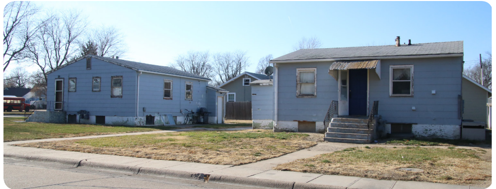
PCDC purchased two homes at 11th and Logan Streets in December with plans to demolish them to make space for new workforce housing.

This program targets neighborhoods that are in despair by encouraging the renovation of dilapidated, vacant, abandoned and overgrown