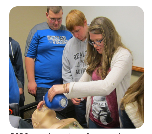
PCDC organizes a tour of area employers for Loomis and Bertrand students to encourage them to consider local careers.

PCDC arranged a panel of local residents that included a registered nurse, the human resources director at Allmand Bros. and an employee of Hawkins Manufacturing. The speakers encouraged the students to evaluate life goals and the cost of education when considering a career. They emphasized the advantages of life and careers in Phelps County, such as low