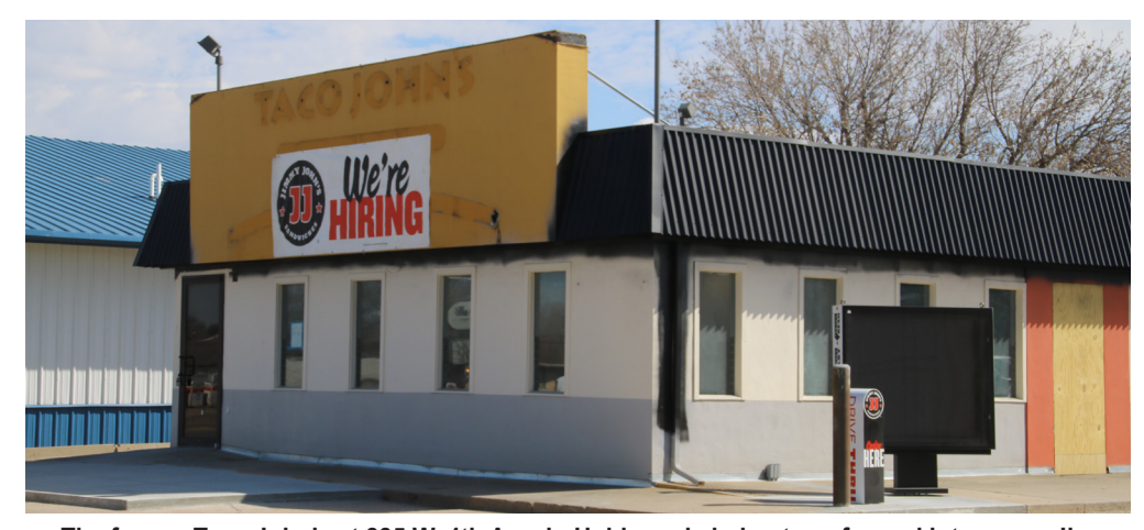
The former Taco John's at 225 W. 4th Ave. in Holdrege is being transformed into a new Jimmy John's restaurant. It is expected to open in mid-April.

The exterior of the building will showcase