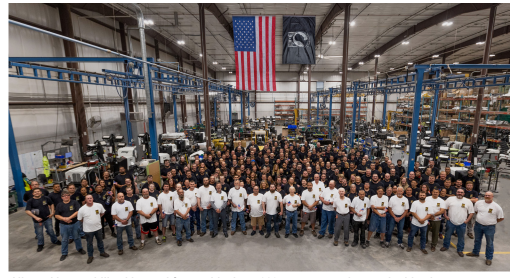
Allmand has stabilized its workforce with about 220 average employees. In this picture, employees who are military veterans are wearing white.

Dooley said Allmand will have the only hybrid light tower with a vertically integrated lithium battery pack. It can achieve 9,000 hours of light