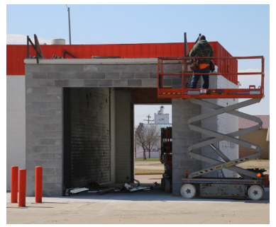
Duster Auto Spa

PCDC is supporting the Duster Auto Spa with Business and Franchise grants.