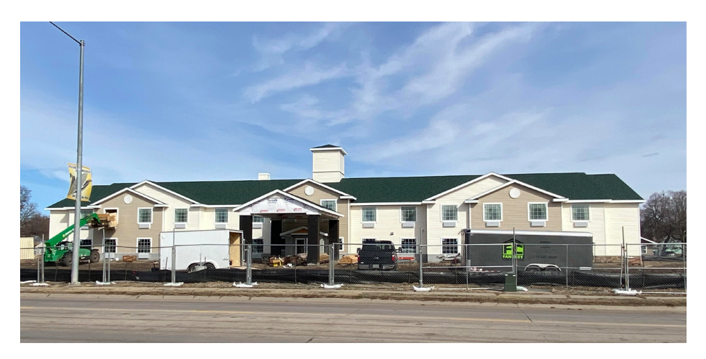
The new Cobblestone Inn & Suites at 814 Burlington has started accepting reservations for stays after September 1. The hotel is expected to open in June. (Photo taken mid-March)

The hotel has a Facebook page (Cobblestone Inn & Suites – Holdrege) where fans can follow for the latest information on construction, hiring and opening updates.