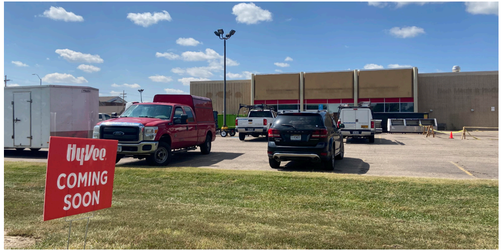
Remodeling has started on the new Holdrege Hy-Vee location on north Burlington Street. The store will employ 11 full-time and at least 34 part-time employees.