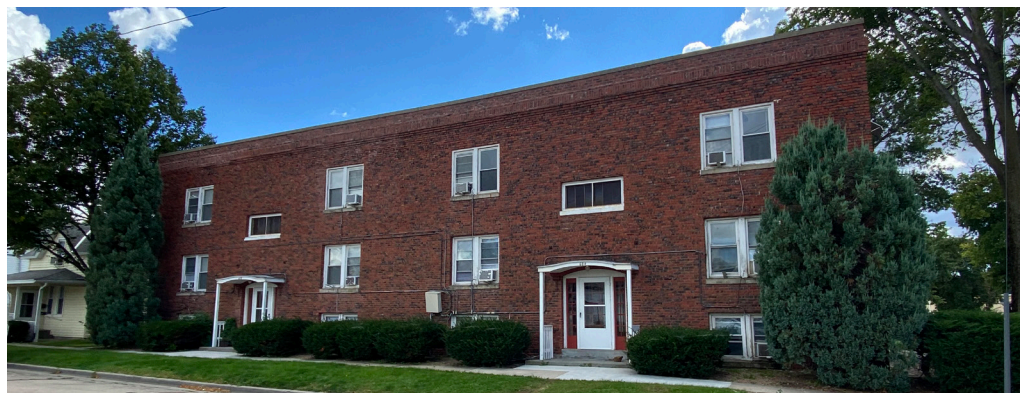
Smart Choice Property Management plans to renovate the apartment complex at 6th & Grant.