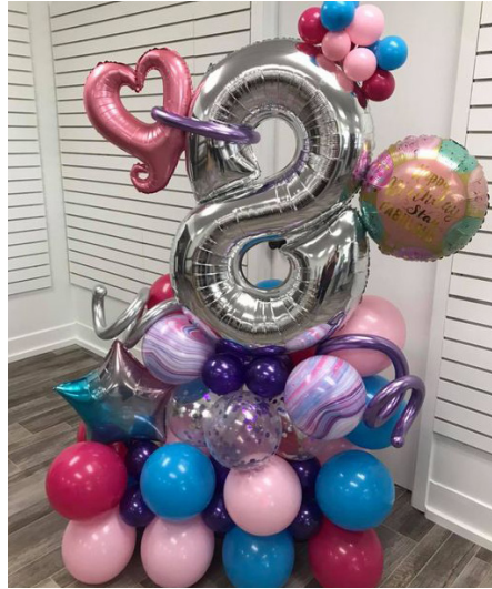
The Guest List specializes in customized balloon art for any occasion.

Development Grant to help with creating a website and joining the Holdrege Area Chamber of Commerce.