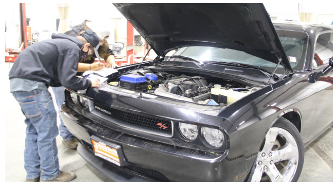
Seventeen students registered for the Janssen Auto Tech training program for the 2021-22 school year.