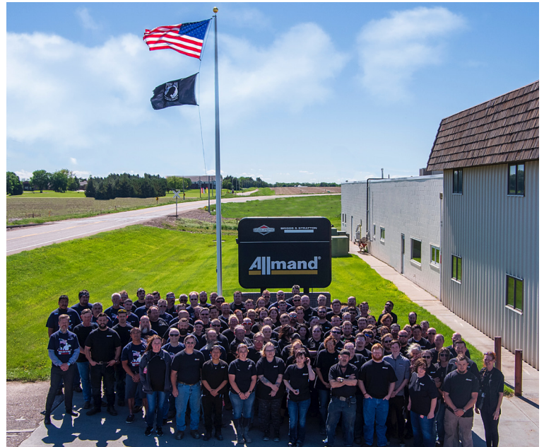
Allmand organized a flag-raising on May 27 as a sign of respect to heroes past present and future who served in the Armed Forces.

"Our senior leadership team at Briggs & Stratton is fully behind the