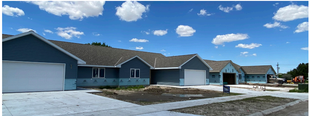
Six new town homes were nearing completion in the CREW subdivision in early June.

McElhinny Builders has been the contractor for the town homes already built or under