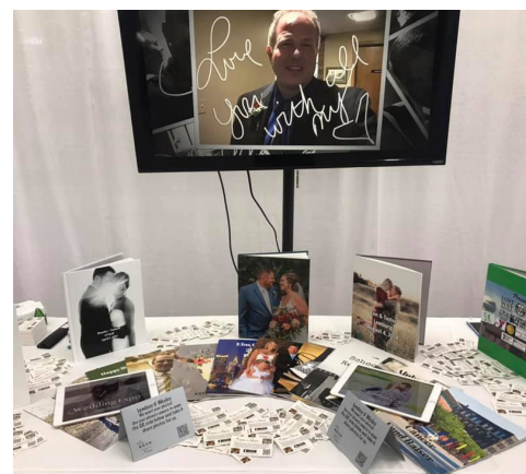
My Digital Guestbook and Pix Bash have been popular around the world.

"What I wanted to do it capture all those candid photos that guests are taking without the hassle of