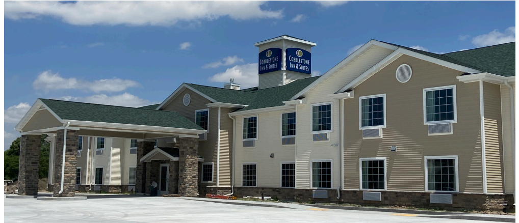
The new Cobblestone Inn & Suites at 814 Burlington will open on July 10.

"Given the impact of COVID-19, it's difficult to predict the next six months but we're gratified to see fairly heavy advance reservations activity," Tillery said. "We're hopeful that the hotel will continue to build momentum as the economy gains more steam in the coming weeks."