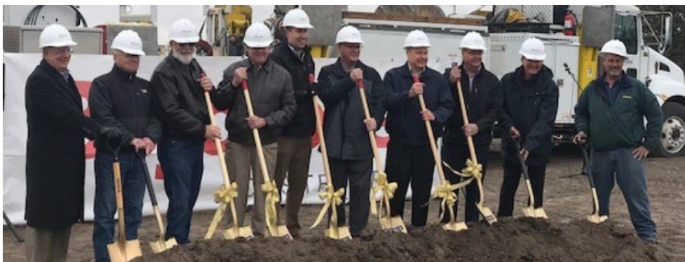
Southern Public Power broke ground on a new service center in Funk in April.

Two ground breakings occurred this spring on major business expansions in Phelps County. Southern Public Power is building a new regional office in Funk, and Allmand Inc./Briggs & Stratton broke ground on its addition, which will add five new assembly lines to the local plant.