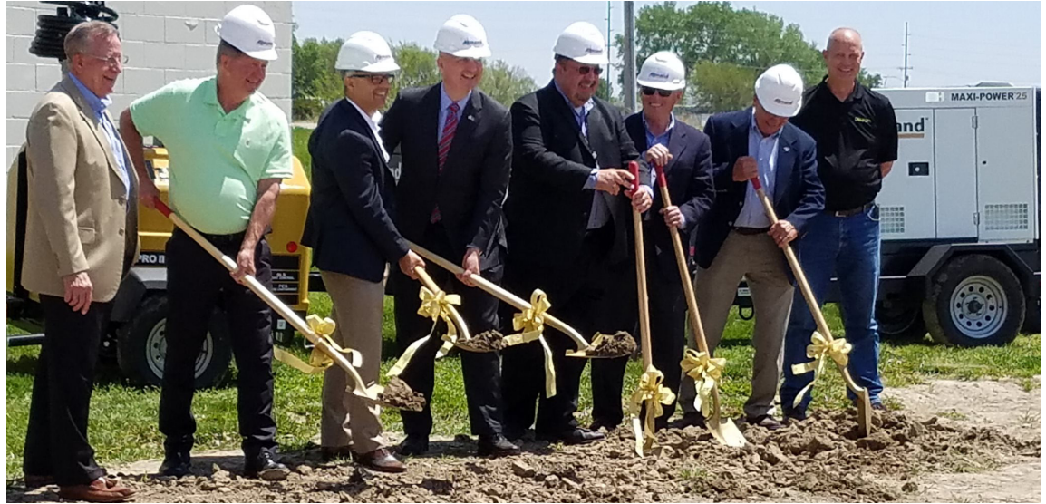
Gov. Pete Ricketts (fourth from left) attended the Allmand Inc. expansion groundbreaking in May.