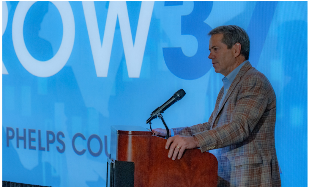
Gov. Jim Pillen gave the keynote speech at PCDC's annual Business Hall of Fame banquet on Oct. 26 at the Holdrege Sun Theater & Event Venue.