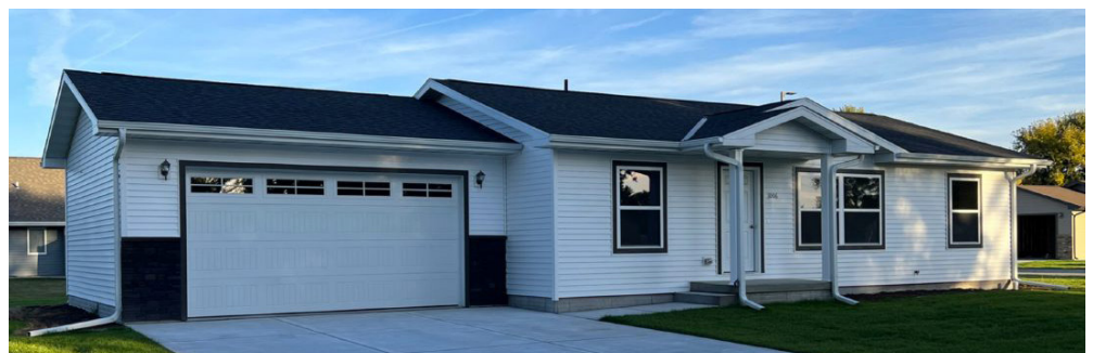
Six new homes are available for purchase in the CREW Subdivision in east Holdrege. Contact any local Realtor for details.

Rent prices will be between $1,100 and $1,275 per month with income limits on three of the units. To inquire about renting at Sunset View, contact the housing authority at HA68927@outlook.com.