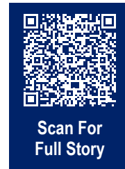
Scan For Full Story

Before Covid, they were confined to living