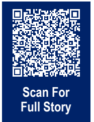
Scan For Full Story