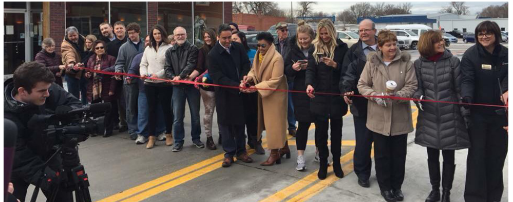
Local business owners and employees lined up to officially cut the ribbon for the Highway 6 & 34 Re-Opening Ceremony on November 29.

The Concrete Solutions team started planning for the project nearly a year before it began. They created a Facebook page to keep everyone