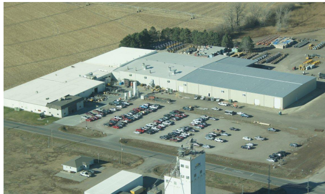
ABOVE: An Allmand employee works on one of the several products manufactured at the Holdrege plant. The company will add at least 20 new jobs with an expansion project announced in December. LEFT: Allmand will expand to the west onto PCDC's Iron Horse Business & Industry Park, becoming the first tenant to build on the property.

press release, the expansion aligns with the company's focus on growing its commercial business. Over the last five years, the company has grown commercial sales by more than 70 percent, and the Allmand business plays an important role in continuing this growth.