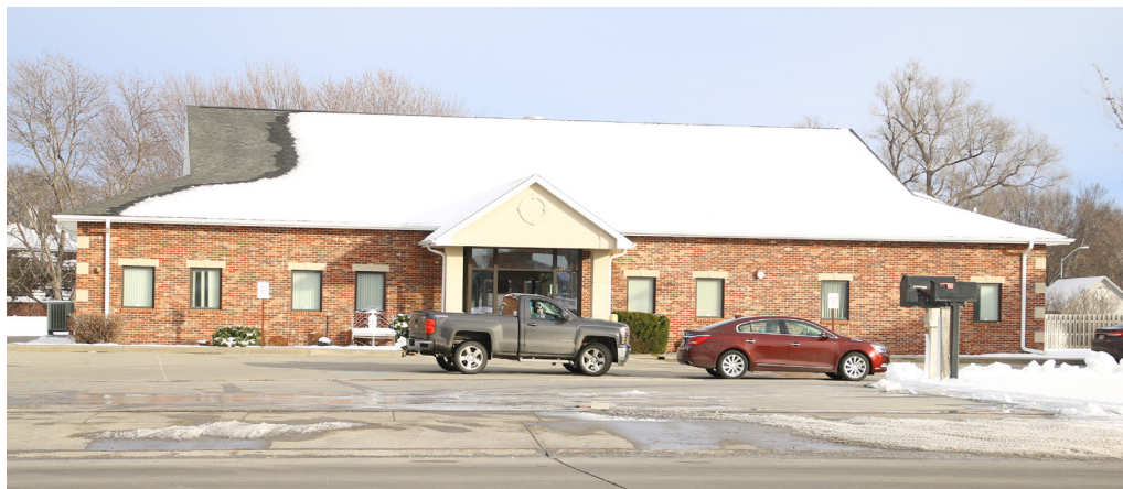
The VA Clinic at 1118 Burlington in Holdrege will begin an expansion project in 2019.

The clinic will remain open during the construction, however some services may be relocated within the building during the process.