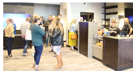
The concessions are now in the north lobby area.

The lobby area is intended for smaller events and meetings. For more information about the Sun Theater & Event Venue, visit www.holdregesun.com .