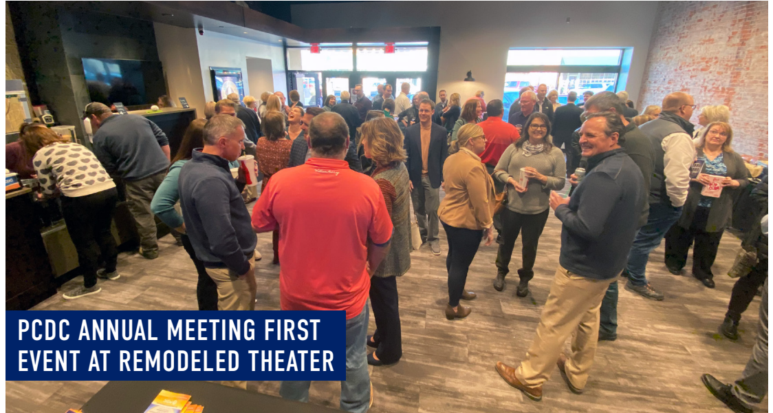
PCDC ANNUAL MEETING FIRST EVENT AT REMODELED THEATER