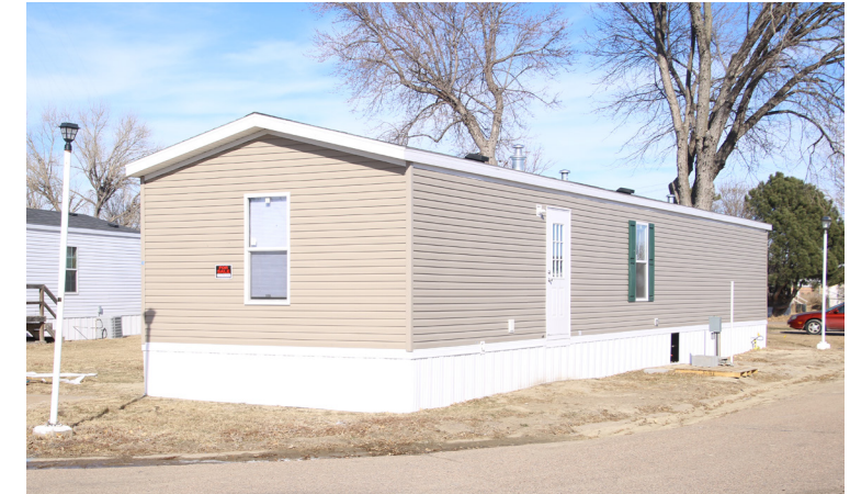
This new mobile home in the Westside Mobile Home park was for sale earlier this year. PCDC is offering $1,000 matching grants to employers to help employees purchase a mobile home.

GenReis recently added 12 homes (four used homes at