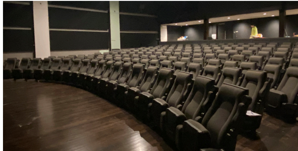
The renovated Holdrege Sun Theater & Event venue will seat 162 in the theater area. A back "mezzanine" area will have 14 swivel seats and tables for a unique movie experience.

502 East Avenue, Suite 201 PO Box 522 Holdrege, NE 68949-0522 ph (308) 995-4148 fax (308) 995-4158 www.PhelpsCountyNe.com