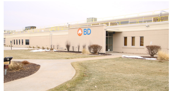
BD has recently invested more than $300 million in the Holdrege manufacturing plant.

In the past 10 years, BD has invested more than $300 million in plant upgrades and expansions in the