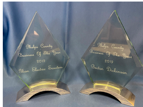
BD and Glion will receive trophies, and their businesses will be on the Business Hall of Fame wall in the PCDC office.

"The payoff may not be fully realized in our lifetimes, but what we do today will sculpt the community that Holdrege will be in 50 years,"