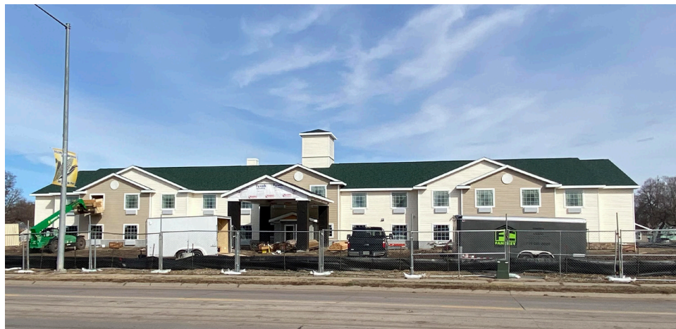
The new Cobblestone Inn & Suites at 814 Burlington has started accepting reservations for stays after September 1. The hotel is expected to open in June. (Photo taken mid-March)

The hotel has a Facebook page (Cobblestone Inn & Suites – Holdrege) where fans can follow for the latest information on construction, hiring and opening updates.