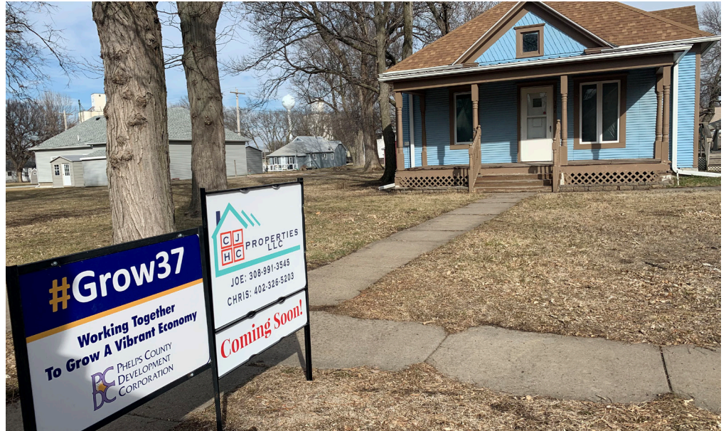
PCDC awarded a GO! HOME renovation and reimbursement grant to CJHC Properties, LLC, to rehab and resell this home at 106 Lowell Street in Loomis.