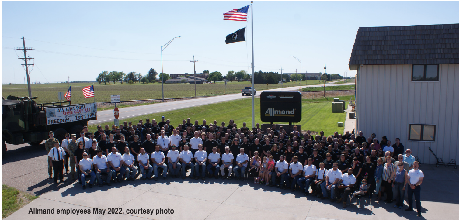
Allmand employees May 2022